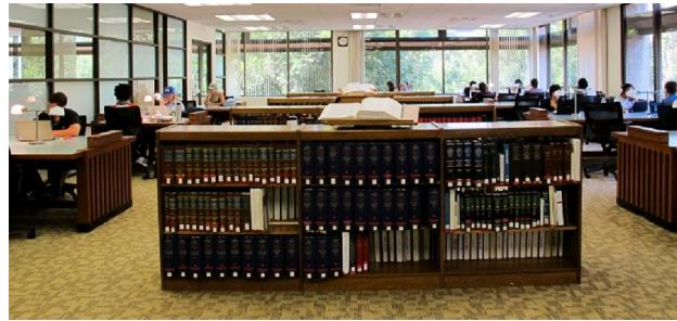
The Law Library

Accounting Library Architecture and Fine Arts Library Crocker Business Library Law Library Wilson Dental Library