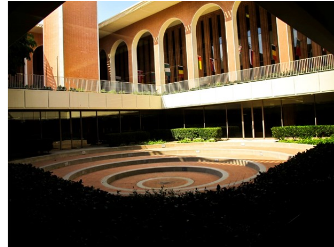
Von KleinSmid Library