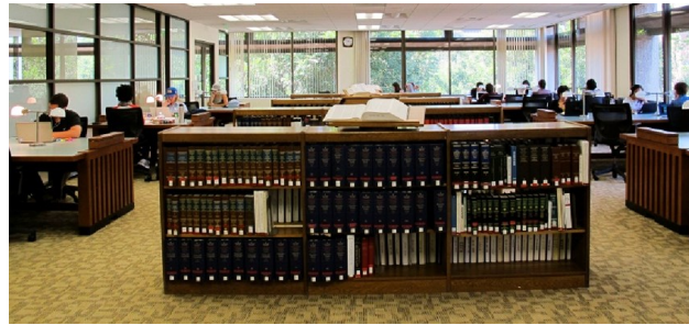
The Law Library

Accounting Library Architecture and Fine Arts Library Crocker Business Library Law Library Wilson Dental Library