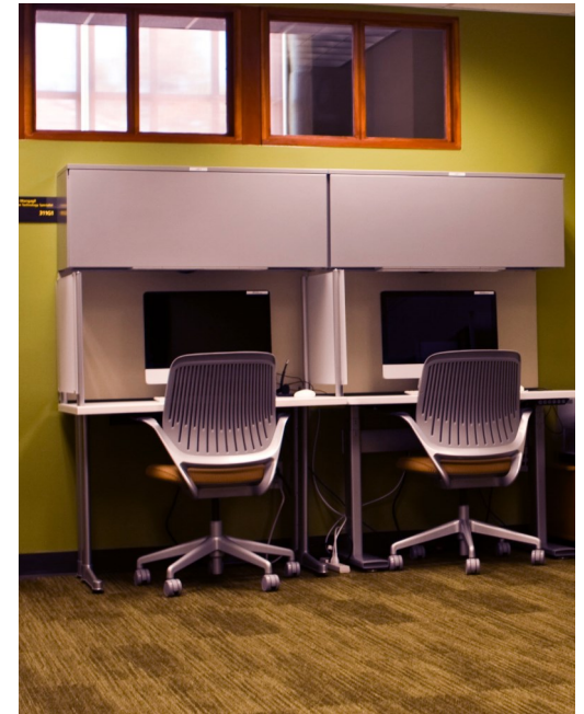
Kortschak Center for Learning and Creativity Computer Lab